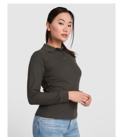
ESTRELLA L/S WOMAN R6636