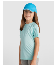
BAHRAIN KIDS K0407