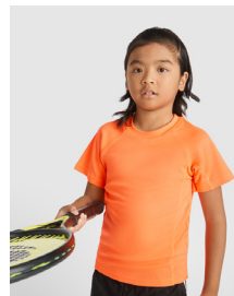
MONTECARLO KIDS K0425