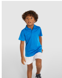
MONZHA KIDS K0404