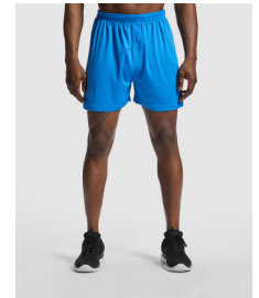
PLAYER UNISEX R0453