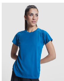
BAHRAIN WOMAN R0408